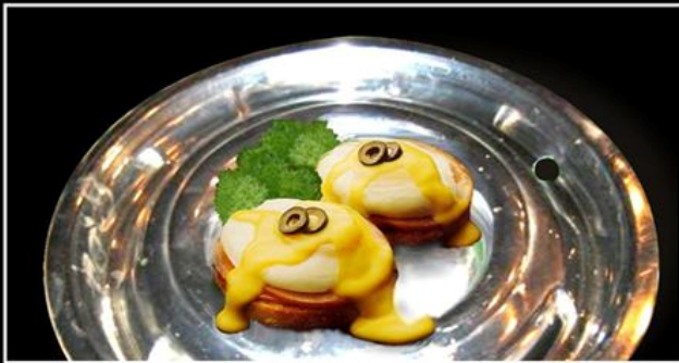
Eggs Benedict served on a hubcap because there's no plate like chrome for the hollandaise