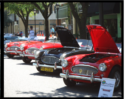
See more pictures on page four